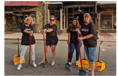
Volunteers help clean up before Festival of Food Trucks Event